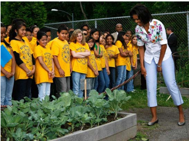
First Lady Obama at Bancroft Elementary School

factors in the physical environment;” opening them can directly increase access to recreation space, especially outdoor green spaces, translating into increased opportunities to participate in physical activities. In searching for ways to increase healthy physical and social habits of both children and adults, public health advocates have identified these public infrastructure assets—public school buildings and grounds—as places that can and should play an important role in increasing physical activity not only among children and adolescents but also contributing to healthier communities. 18 In some communities neighborhood schools may be one of few places where children can be involved in active play.