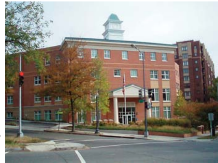
Oyster Elementary School

In this environment characterized by crisis, the 21st Century School Fund (21CSF) was founded to help develop the first district-wide facilities master plan in two decades and to manage a public/private partnership for the DCPS Oyster Bilingual Elementary School. Through our work on these projects we amassed information and developed expertise on the facility needs and challenges facing the District's public schools.